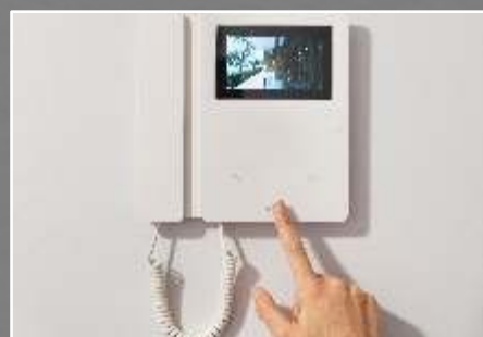
Video Door Phone