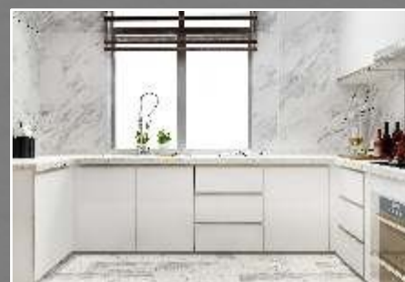
Modular Kitchen Trolley